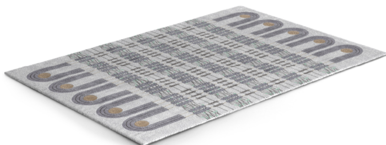
■ R882001XNA (draft Image)