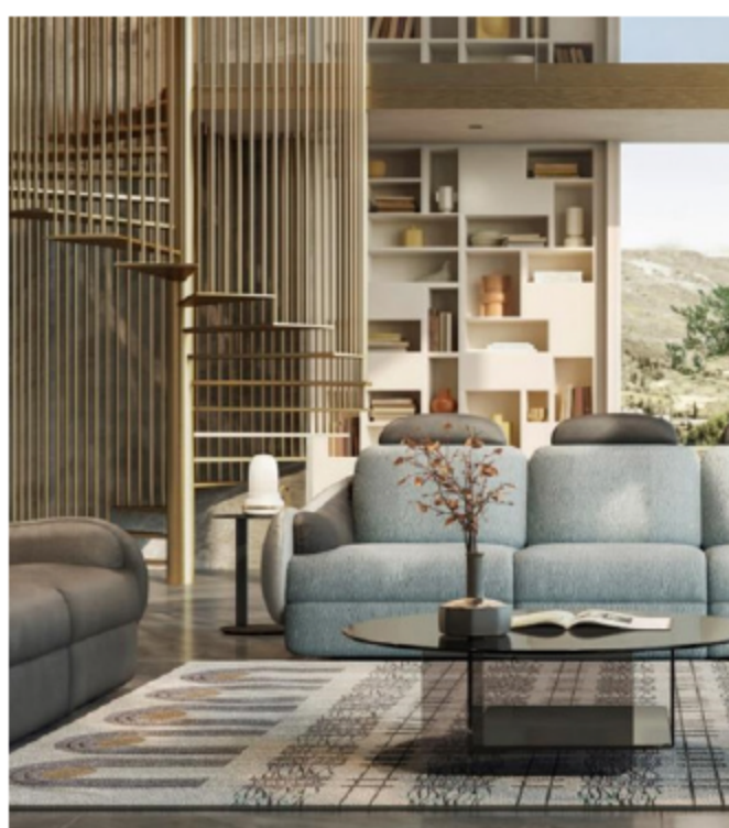
■ Detail (draft Image)

ALL PICTURES SHOWN ARE FOR ILLUSTRATIVE PURPOSE ONLY. ACTUAL PRODUCT MAY VARY DUE TO PRODUCT ENHANCEMENT.